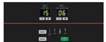
Dual Digital Control