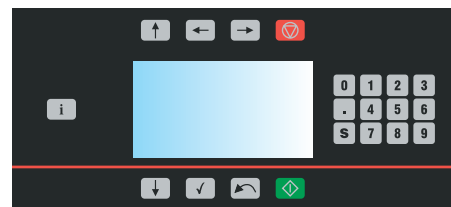
Control panel (QED Select)